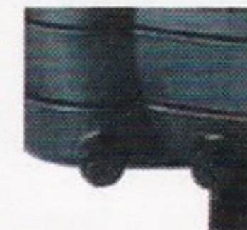
Drainage caps for convenient servicing