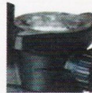
Easy access to the pre-filter through the quarter turn cover