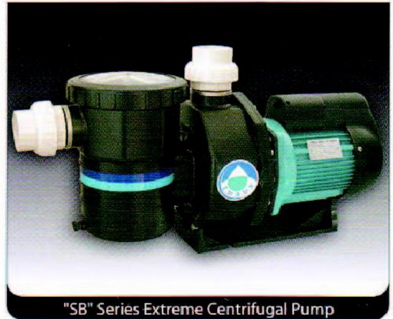
"SB" Series Extreme Centrifugal Pump