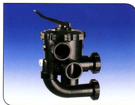
4- or 6-Position Multiport Valve